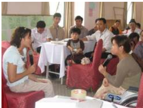
The workshop facilitators demonstrate model peer counselling techniques in a role play.