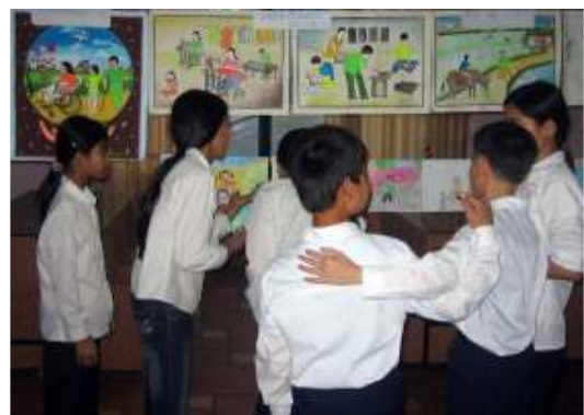
Contributions to the competition on awareness raising

On one evening, a dinner was organised to award the winners of the competition for the awareness raising campaign. This competition was initiated after the last workshop on "Advocacy and Lobbying" in September (see previous newsletter). The task was to develop ideas for slogans and concept which will later be used for posters and TV spots. The winner of the competition was a young woman with a hearing impairment, with the slogan "We are not different from others" - "We are different because we can read and listen by the hands".